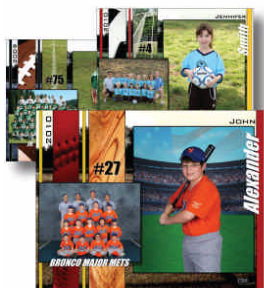
Team Mates 8" x 10" additional designs available

all calendars are 12 months beginning with the month of purchase