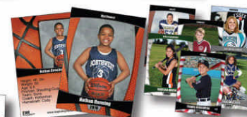
Trading Cards pro-style cards - 8 or 16 per pack customized stats on the back of every card not all designs shown