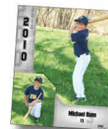
Two Pose 8" x 10"