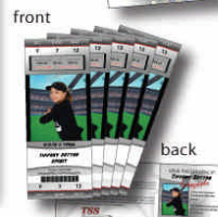
Standard Event Tickets set of 5