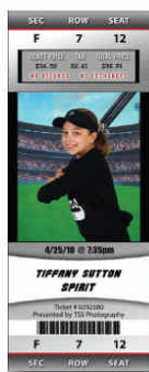
Jumbo Event Ticket 14" x 5"