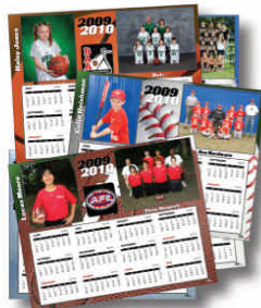
Calendar Mates 8" x 10"